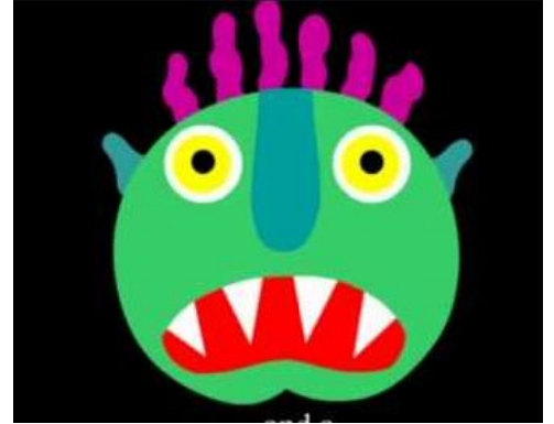
Big Green Monster