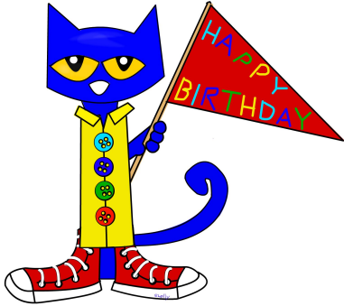
Pete the Cat